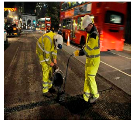
Inlaid Single & Multiple Cracks