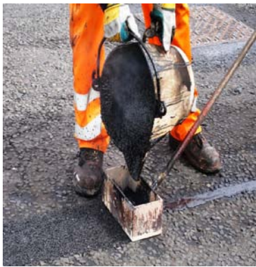
Fill & Overband