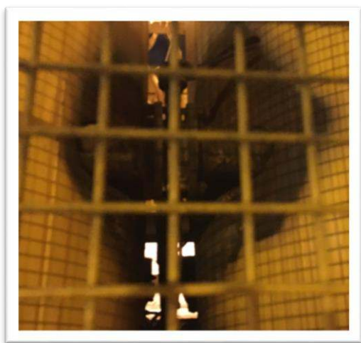
Location of Fire

A gas torch was being used to heat the knuckle between the two boilers on the bed of a Feeder Wagon used for white lining works; there was a leak on one of the pipes to the diesel burners which hit the naked flame of the torch and set the wiring on fire, which being plastic melted causing a fire to take hold.