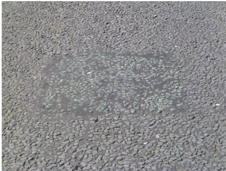
2011 – Showing repair in carriageway after 14 years