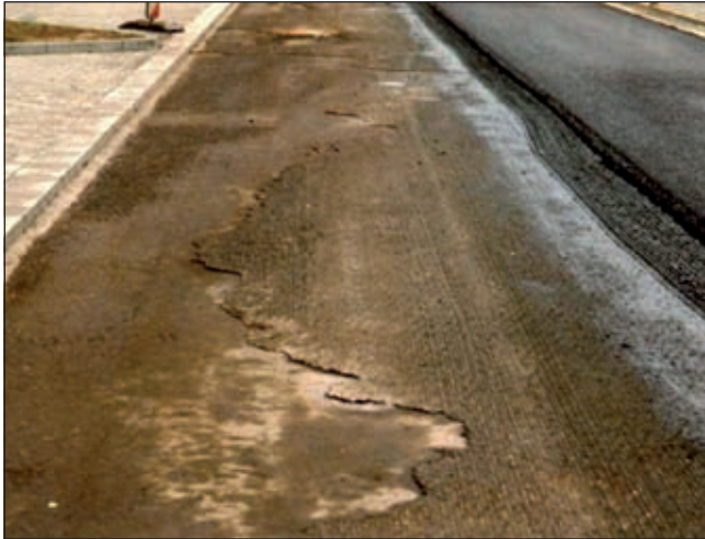
Condition of Rosenstrasse before overlay, May 1996

reinforcement has proved a success in every respect. Up to present, placing the asphalt reinforcement under the asphalt-concrete 0/11 surfacing course has prevented any cracks from appearing in the asphalt-concrete road surface...".