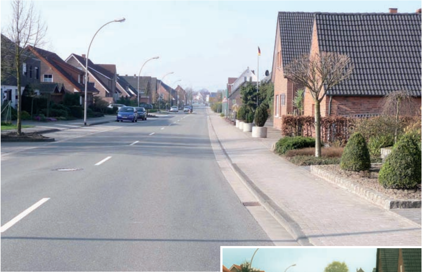
Condition of Rosenstrasse in April 2009